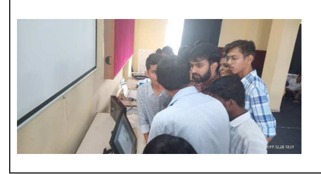
Students while working with Pen